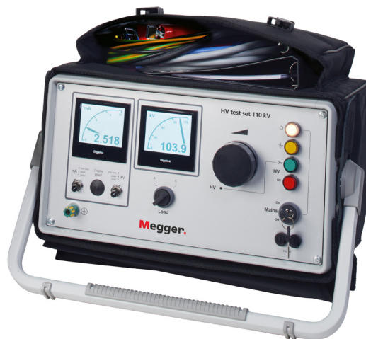
Analog and digital version of control unit HV test set 50/80/110/120 kV

* The information in this document is subject to change without notice and should not be construed as a commitment by Megger Germany. Megger Germany assumes no responsibility for any errors that may appear in this document.