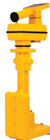
3M™ Dynatel™ iD Marker/EMS Tape Locator 7420