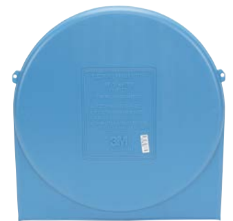
3M™ EMS Full Range Marker Suited for deep applications of up to 8–9'