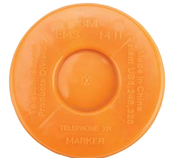
3M™ EMS Disk Marker Ideal for marking at shallow depths of 3–5'