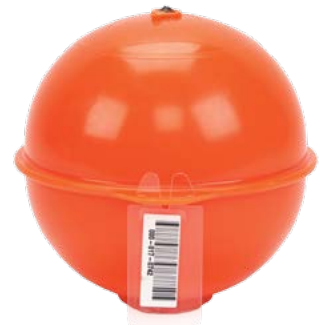
3M™ EMS Ball Marker Self leveling feature, suited for depths of 5–6'