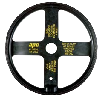
3M™ EMS Mini-Marker Designed for maintaining a stable position after placement at depths of 6'